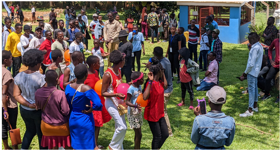
Youths engage in Team building Exercises during the TC Hangout.

This year, we prepared a dance gala where we got an amazing number of young people. Initially we expected around 50(maximum) but 110 attended. The young people displayed their various talents. The TC dance crew joined in.