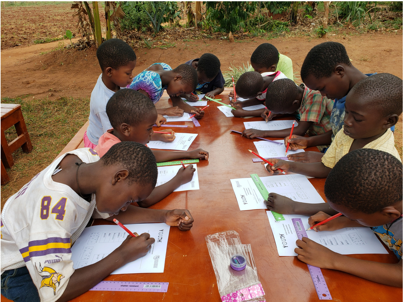
Children attending Classes and doing assessment exercises provided by YOUTH.