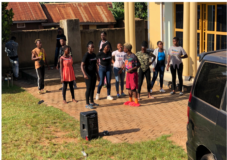
Youths practice dance routines during the TC Gala.