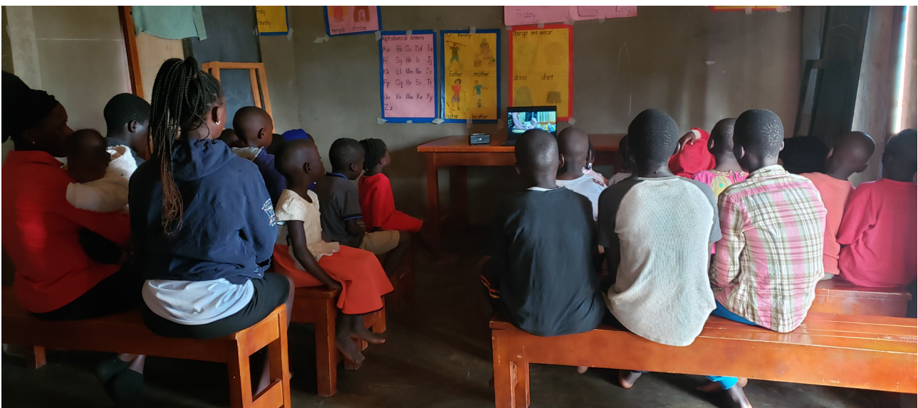
Children watched Matilda and Home Alone during the Movie Days.