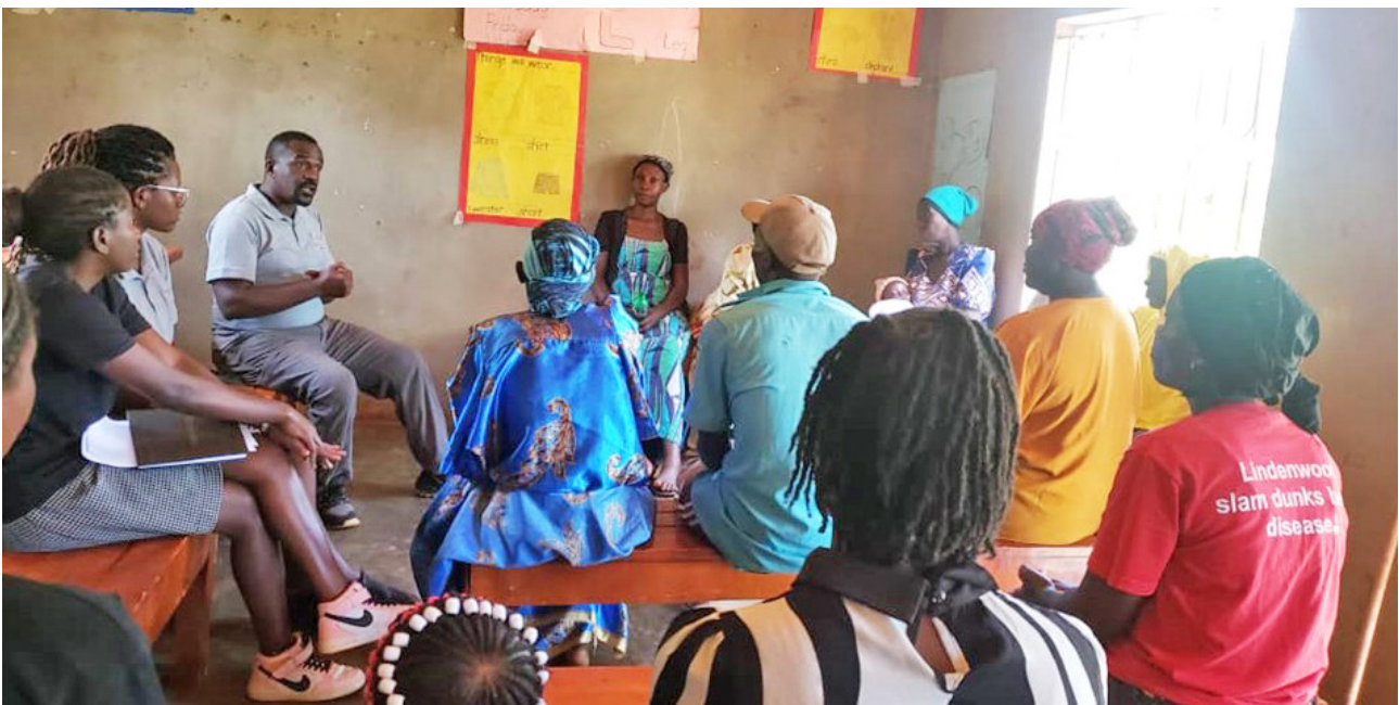
A Parents Meeting in session.

The first parents meeting took place on 27 April 2023. Purpose of this meeting was to get feedback from the parents about their