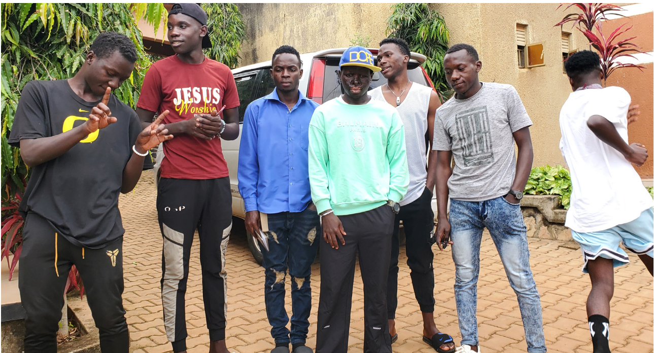
Select members of the program

The 24th November event purposed to create a free space for the boys to discuss issues and generate solutions within their grouping. We brought in men mentors who imparted words of wisdom to the young boys. To create a good and free discussion environment, the training took place at Viska Resort with good ambience..