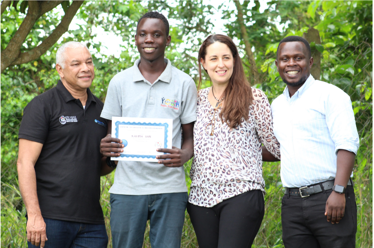
Trained Tutors received certificates.

children's progress and for Youth Consult to respond to any queries from the parents.