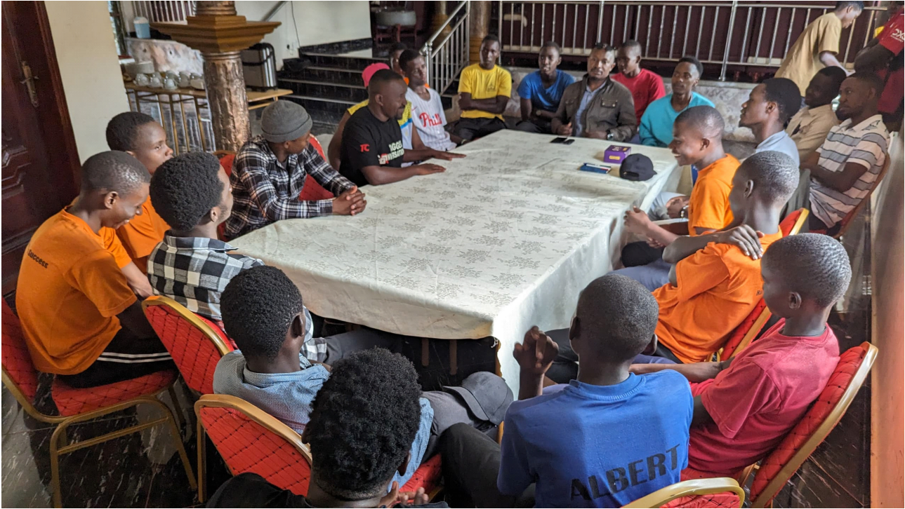
The boys in a brainstorming session

The key discussion point was on identity but split in a series of sub themes. The facilitators provided insights on each theme before they delved into discussion. In these sessions, the boys were able to freely speak out and figure out solutions. In the course of discussing, the boys asked a series of lifestyle questions which the facilitator ably answered.