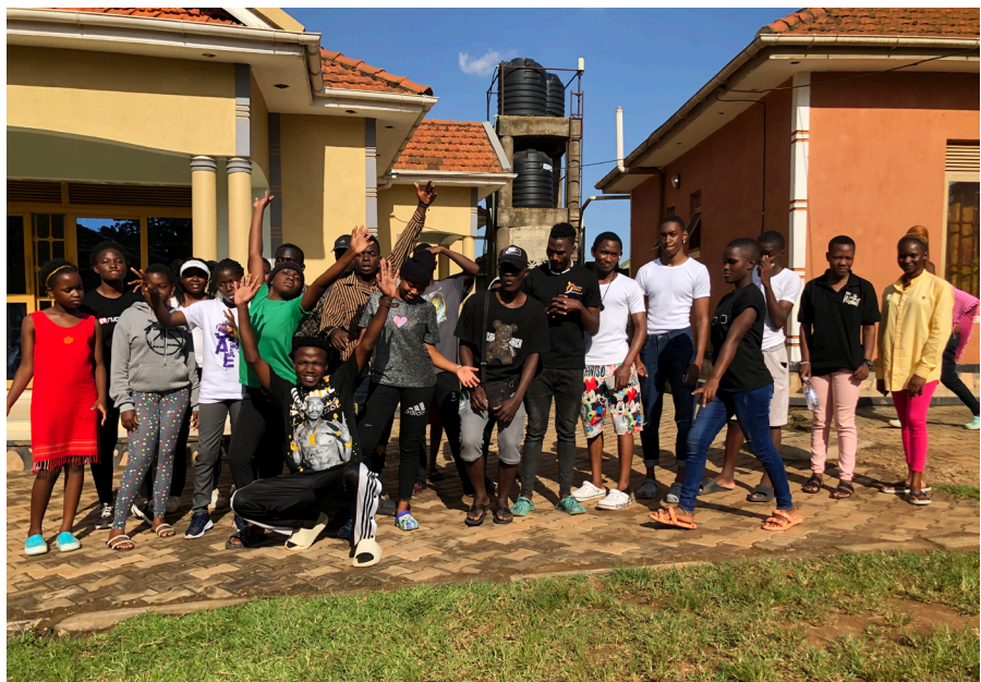
Some of the youth participants in the Games Day