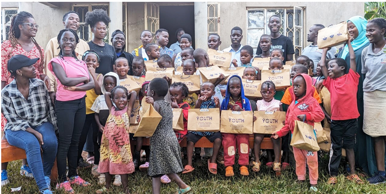
The YOUTH team delivered gift hampers to the children's homes