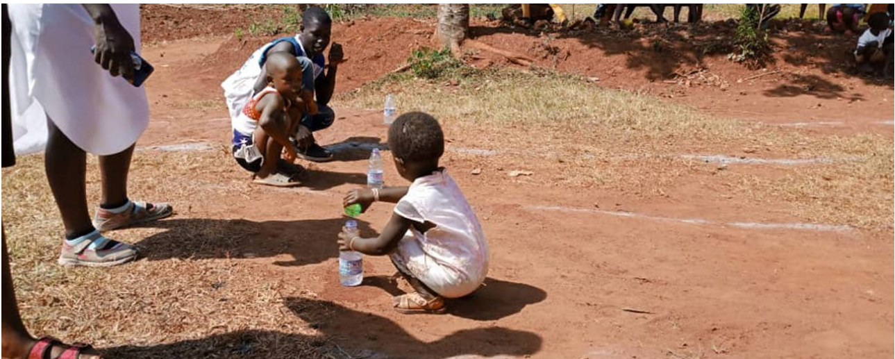
Sports & Games create fun for the children

The project team Organized two movie days for the children. Children watched the movies: Matilda and Home Alone. On top of learning, the children and teachers greatly enjoyed watching the movies. This served as a good break from the rigors of class.